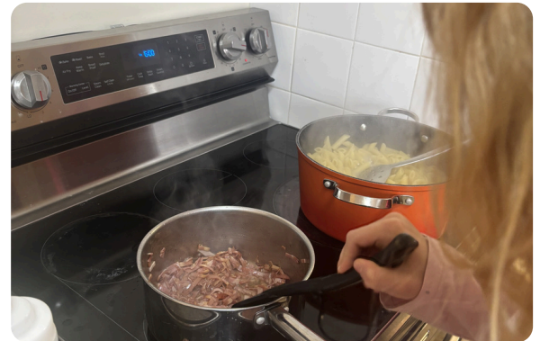
Kids in the Kitchen