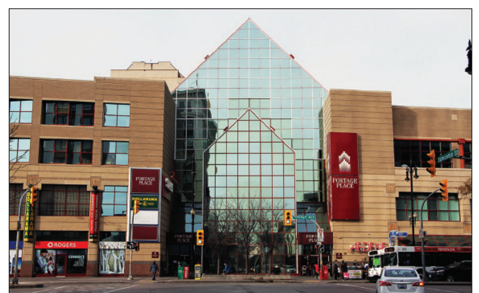
Portage Place became our new home in 1994