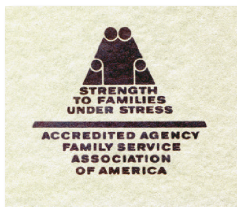
Homemaker ad 1969