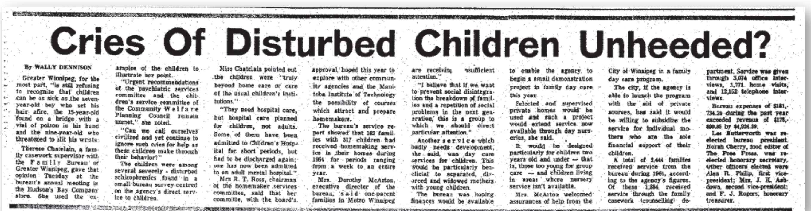
Winnipeg Free Press 1965 Winnipeg Free Press Archives