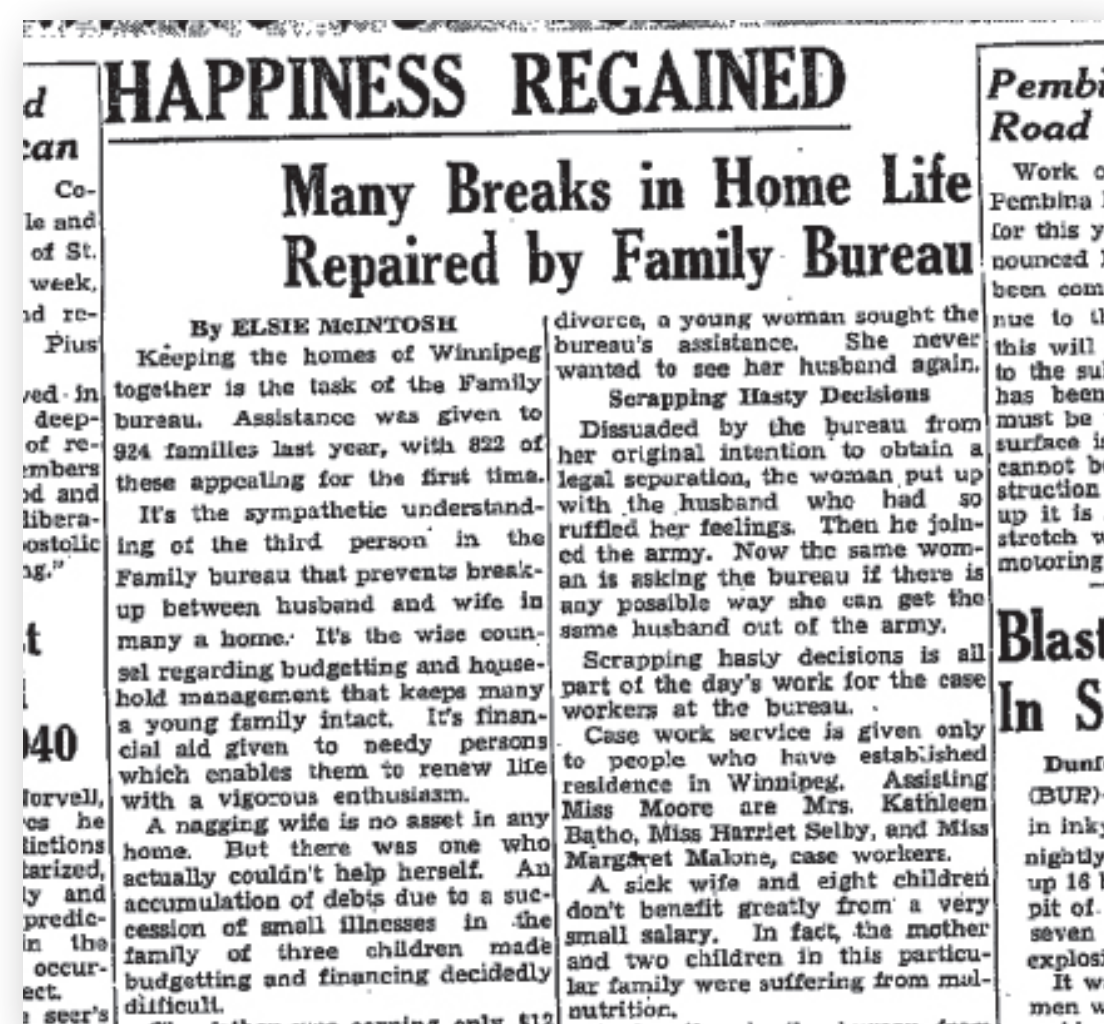
Winnipeg Free Press 1939 Winnipeg Free Press Archives

University of Manitoba Archives and Special Collections