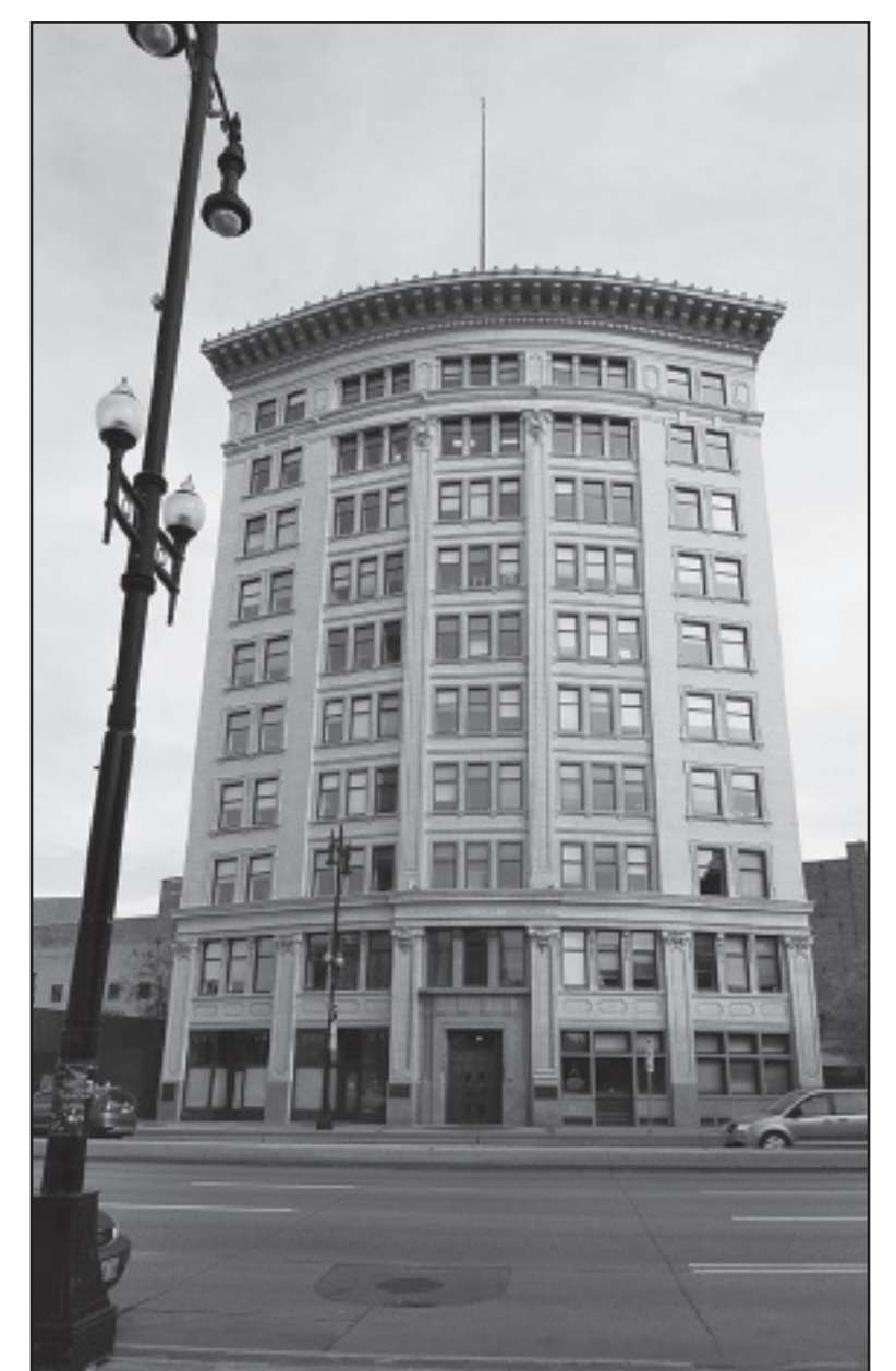
Our first home, the Confederation Life Building, 457 Main

Plans were made for the mother to go for a rest, the children to go to camp; the budget was gone over and some financial assistance given for a short time to enable the family to begin paying off their debts in an orderly manner.